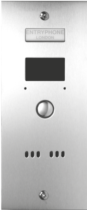
Brushed 316 Stainless Steel