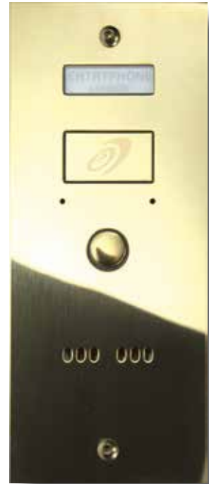
Polished CZ108 Brass