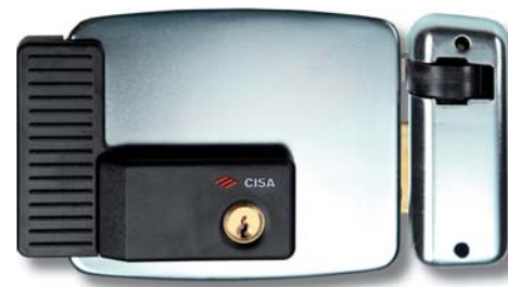
Part No. Description