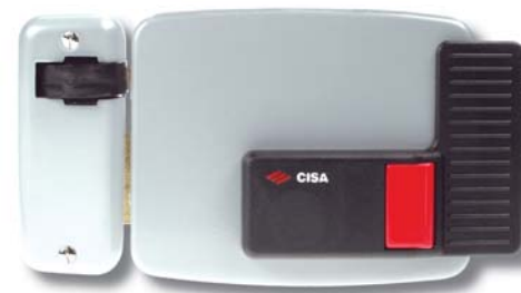
Part No. Description